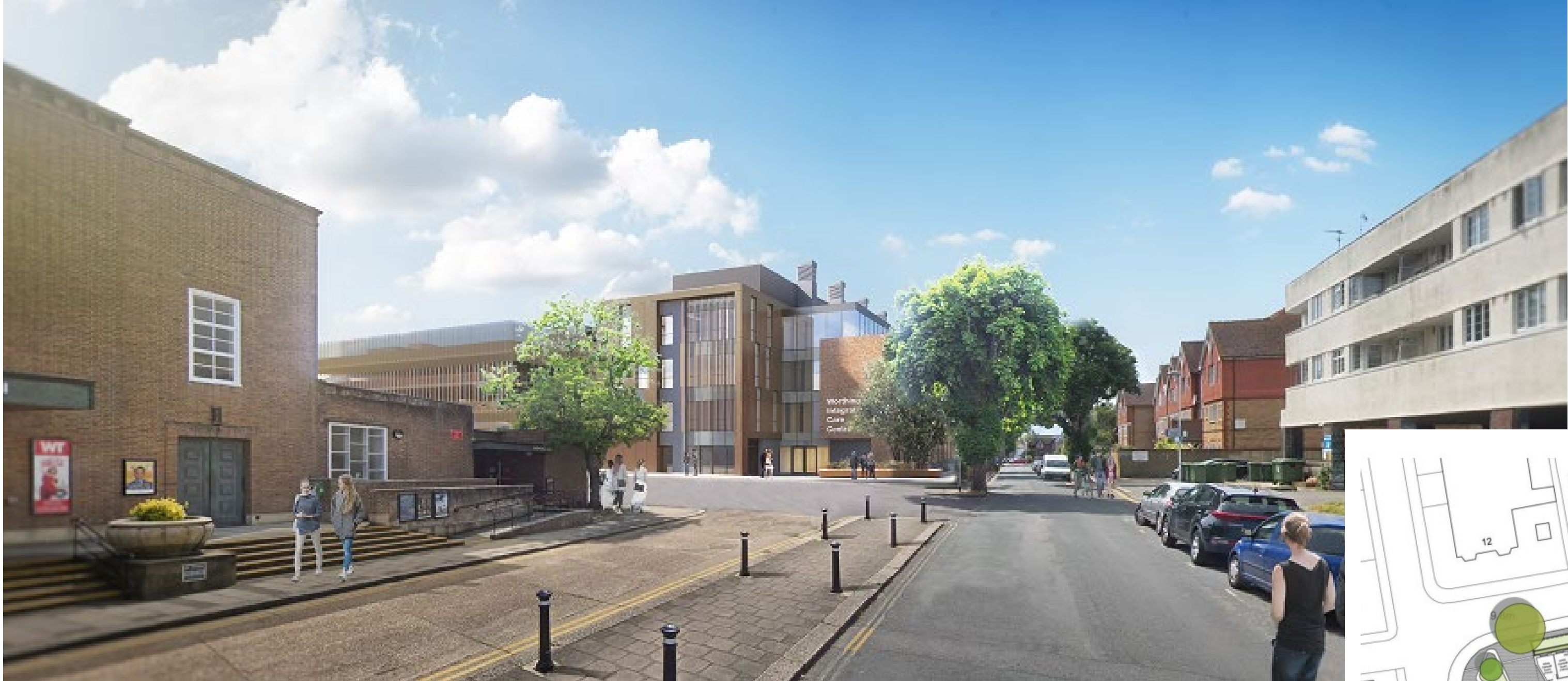
CGI of the exterior of the building, ArchitecturePLB