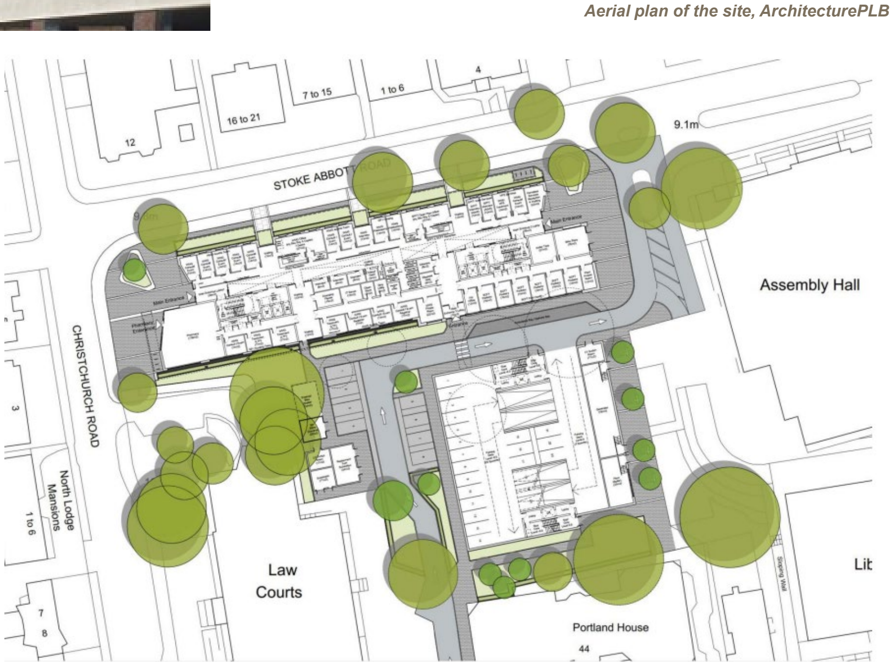
Aerial plan of the site, ArchitecturePLB